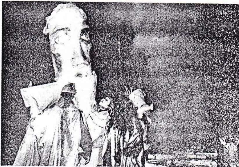
Meet puppets: Alphabet City revels in the Winter Candle Lantern pageant (Sat 27).