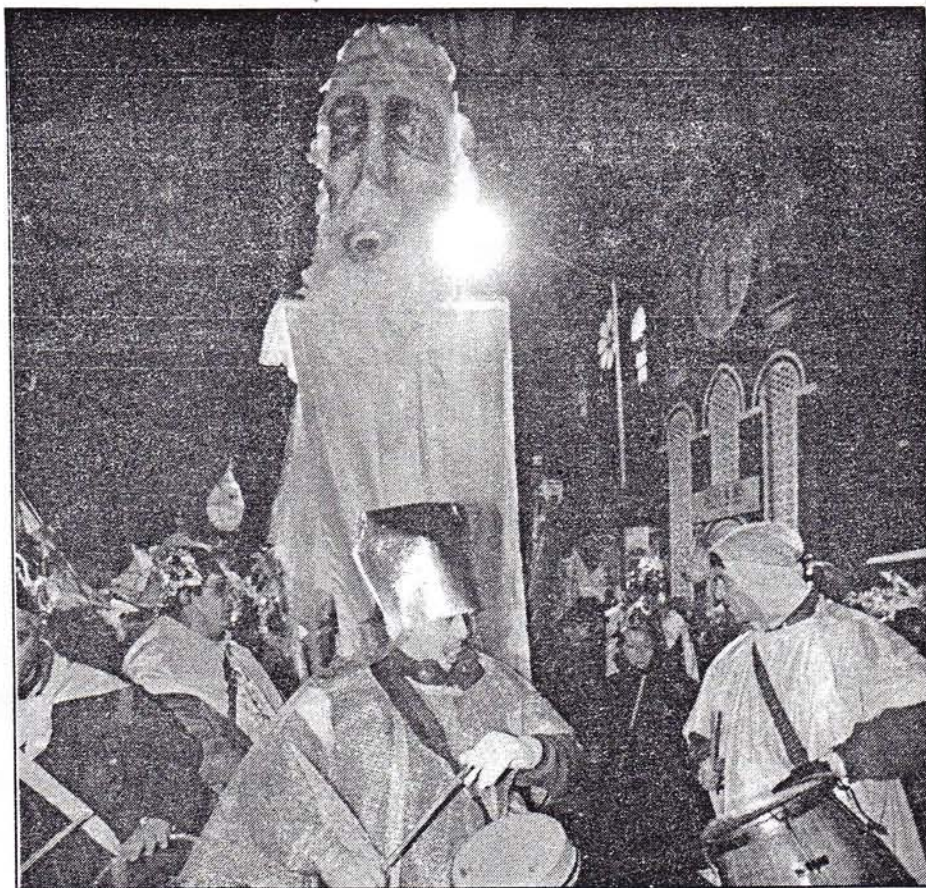
Villager photo by Brad Rickerby

West Village, East Village, Soho, Tribeca and Lower East Side